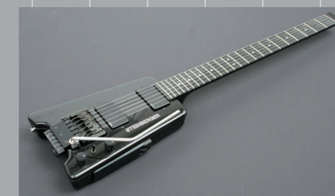
GL2T (regular production model)

GL prototype is mentioned as tested by Steve Morse, Arlen Roth, (Musician Magazine July '83)