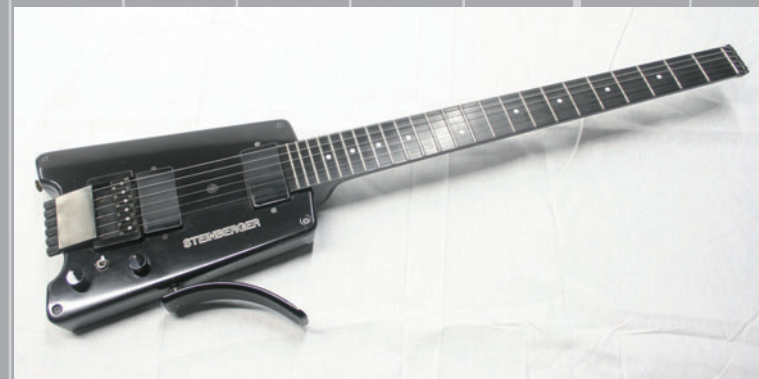
GL2 late prototype (August 1983) (features identical to pre-production models, yet no serial)