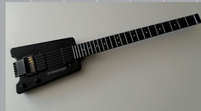
GL2 regular production model