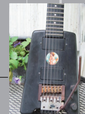
First TT1 prototype #2049