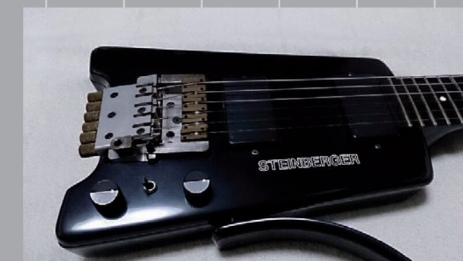
Another TT1 prototype #2311