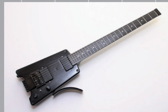
GL2 early prototype